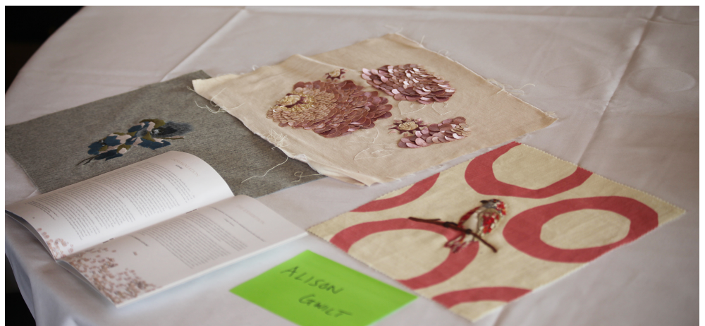
Figure 2- Physical 'Things' brought to the workshop.

Staff had 15 minutes to independently view all of the provocations after which participants were given a questionnaire that required them to describe what had been brought and then respond to the four questions below. The focus of the questionnaire was to illicit both reflective information about the provocations and