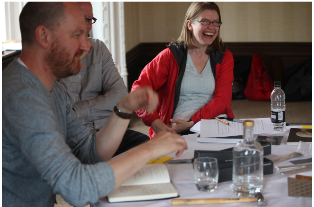
Figure 3 - The Space|Time|Place workshop event.

These activities gave staff the opportunity to take the necessary initial steps in proposing projects and undertaking practice-based research themselves, and quickly led to initial discussions around the development of interdisciplinary research teams based around shared research interests - discussions that would otherwise have been unlikely to happen (Figure 4).