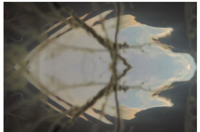
Belper 2014 1