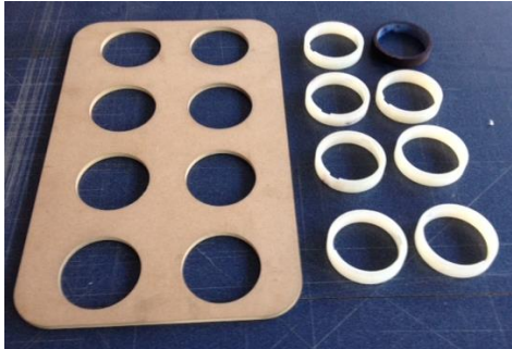
FIGURE 1 SPHERICAL SUBTEST SETUP

A second wooden board is used for the 113mm subtest. The dimensions of the board are 440mm x 365mm, and 15mm deep. The board has 6 holes. Each of the holes measures 15mm in depth and 113mm in diameter. Holes are separated from each other by 44mm in 2 rows of 3. The Extended Spherical subtest uses 6 circular-shaped plastic objects. The objects are 112mm in diameter (Figure 2-C).