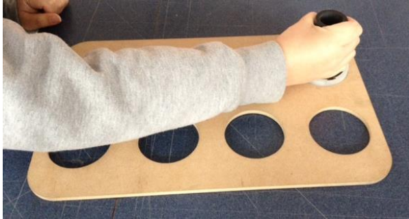
FIGURE 3 PARTICIPANT PERFORMING THE VDT-CYLINDER SUBTEST

The following verbal instructions should be provided to the participant: "Please start with your dominant hand. Start by picking up the object at the top [point to object] and place it in the hole at top opposite side of the board, pick and place all the objects as quickly as possible, finishing with the object at the bottom of the line. If you drop an object, time is stopped, and a 5-second penalty is added. Continue to pick and place the objects with the object that you just dropped. The clock starts where it was stopped, and the time is continued."