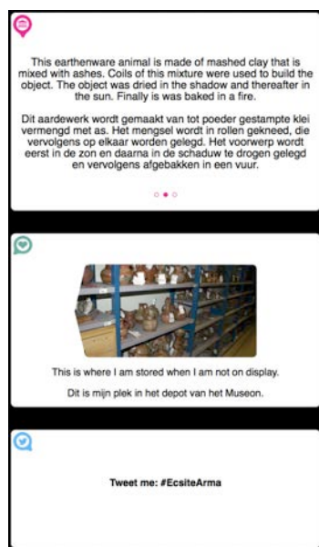
Figure 7. An example of the content projected on the case front glass.

exploration of Twitter on the exhibit floor brings disappointing results. Very few tweets were sent to the cases. We are inclined to believe this is due to the cases being in an unsuitable position (not a high-traffic area) and at an ill time in the visit: sending a tweet would require visitors to take their phone out and so, actually, would interrupt the visit. We speculate that a positioning where there is high traffic and people are killing time, such as the museum cafe or the entrance hall, could give much better results. The experts in MUSEON are also convinced the cases could be an excellent way to attract interest to the museum if they are placed in a different location, such as a station or the city hall. This last option is currently being explored for some of the objects in the deposits for which there is more than one exemplar and are less fragile. We can speculate that in that very different context the humorous aspect of the interaction and the potential high contribution of other viewers could make the cases provocative and memorable.