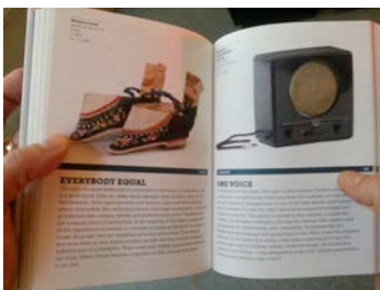
Figure 3. The extended catalogue of objects stored in MUSEON's deposits. The Chinese shoes and the Nazi radio were both used.

visitors would not know of the competition unless they have read the poster or a flyer; we considered the natural behaviour of visitors to be enough at this stage.