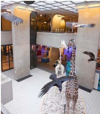
Figure 2. MUSEON exhibition floors. The picture is taken from the landing on the first floor (permanent collection). The cases are across the hall against the pillar.