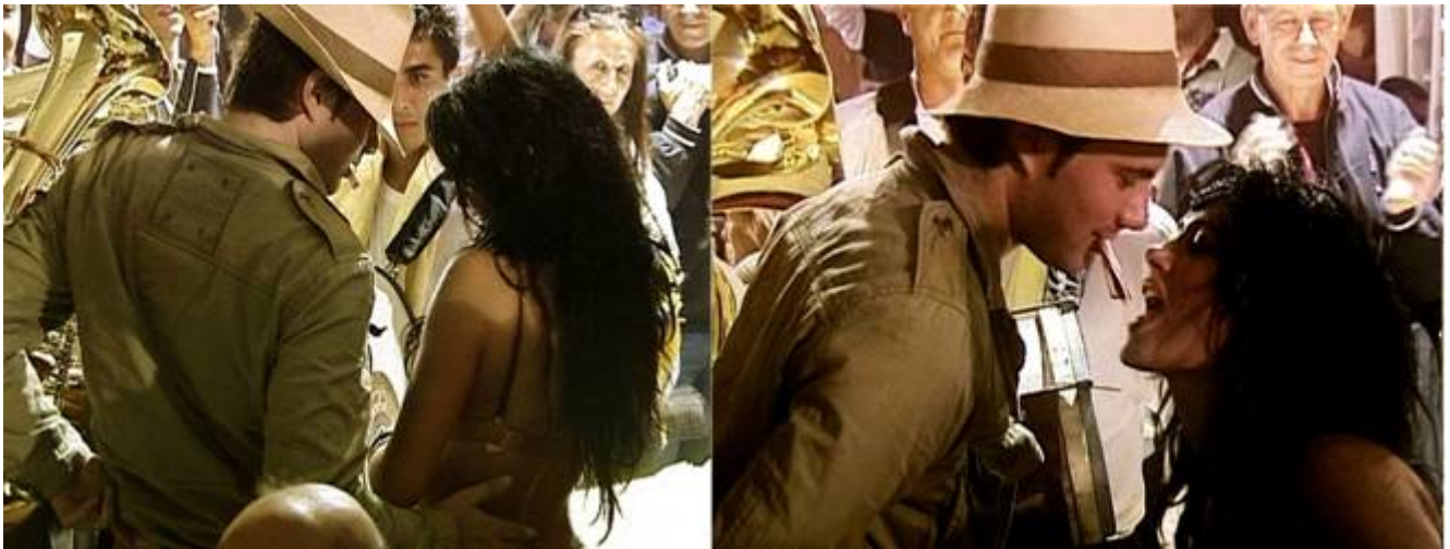
Figure 1. Stills from The Most Beautiful Woman in Gucha, Breda Beban 2006.

The edited version (Figure 1) focuses on an interaction between two people: a professional dancer performing at the event and a young man who very briefly dances with her while she is performing. In the context of the complete unedited video this is a very fleeting passage and might not be noticed by a viewer. Beban has homed in on the interaction between her two main characters and by the use of highly selective editing and slow motion passages to amplify the key moments has revealed an intense, if fleeting, engagement. In the normal speed sections we hear the energetic music and hubbub of the event but when the couple move together for their artificially prolonged exchange the soundtrack changes to a slower, romantic, sensual music to accentuate the intimate hidden moments revealed by the artist.