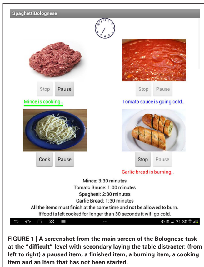
FIGURE 1 | A screenshot from the main screen of the Bolognese task at the “difficult” level with secondary laying the table distracter: (from left to right) a paused item, a finished item, a burning item, a cooking item and an item that has not been started.

Level one of the CT required participants to cook two items within 2 min (Easy level), level two consisted of four items to cook within 4 min of cooking time (Moderate level), level three consisted of six items to be cooked within 5 min (Difficult level) and level four required participants to cook six items within 5 min and included a separate distracter task where the participant must lay a virtual table concurrent with the CT (Dual-task level). During the Dual-task level of the task, the screen additionally included an image of a dining table and crockery items. To lay the table participants were required to drag and drop items (a fork, knife, spoon and plate) to each of four empty table settings (participants could switch between this task and the primary CT for the task duration they had to complete the task however within the overall 5 min duration—see Figure 2 ). Performance on the secondary task was scored on a pass-fail basis. The time to complete the CT, ranged between 17–35 min, but