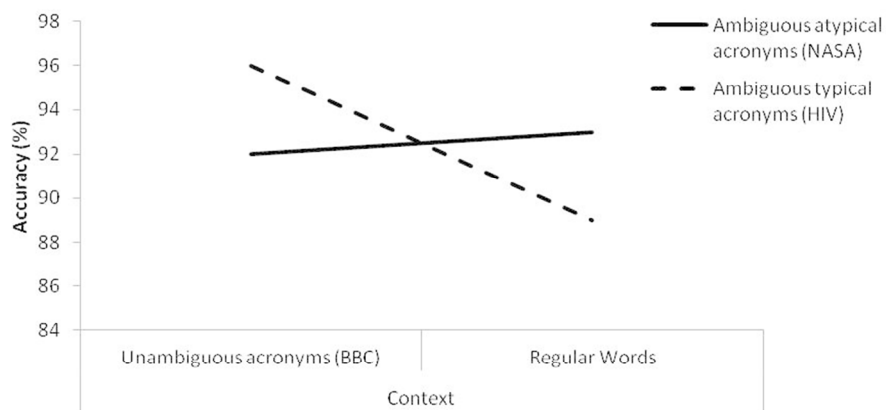
Figure 2 - Mean accuracy (%) for ambiguous acronym stimuli presented in different contexts to normal readers 165x76mm (150 x 150 DPI)