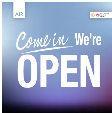
Figure 2 – Logo and colours for the first case study

A website 4 was also created to provide information about the project to potential participants, as well as acting as a way to spread information about the project.