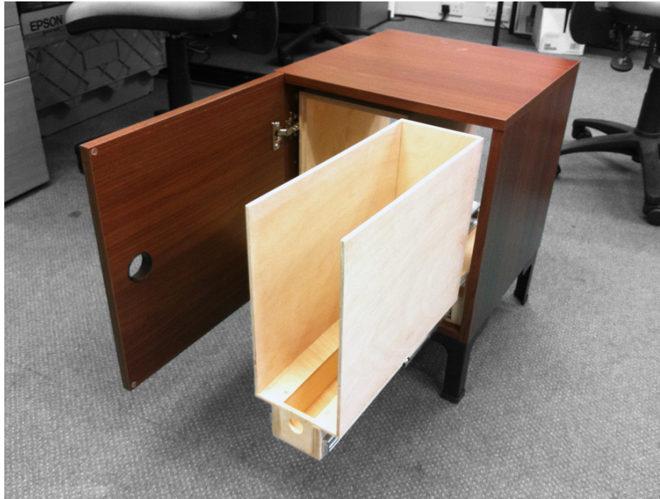
Figure 6 – The 'Treatment Cabinet' prototype

There were other aspects of this prototype that are still in development. One of the community members suggested that a refrigerated portion of the device would greatly enhance the use, and as such two of the community members (one being the researcher) have continued development specifically on this aspect. This initial insert was shipped to the community member who had the original idea, so that the user could provide an evaluation. The plans for the prototypes are in the web space, making them available to be viewed, produced and modified.