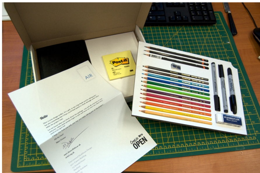
Figure 3 – Example of the welcome packs distributed to community members

In order to allow the community members to develop their ideas, and facilitate the design process each member is sent a welcome pack that contains stationary traditionally associated with design activity. This welcome pack is branded a 'design toolkit', and is modelled on the ideas of Toolkits for Innovation and Design (Franke & Piller 2004), which aim to allow people to 'un-stick' the ideas they have, and communicate them to others. An example of the welcome pack is shown below: