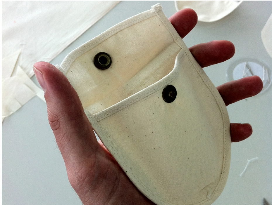
Figure 5 – 'Pocket Pocket' drug storage prototype

The second prototype originated from a different community member, and concerned the use of physiotherapy vest treatment. This involves the use of an air compressor, which inflates a vest causing it to tighten around the user's chest. The air supply is then oscillated to produce the same effect as traditional physiotherapy to remove the mucus from the lungs. This treatment is effective as part of the daily self management of Cystic Fibrosis, however the product makes a big impact on the user's quality of life as there is no solution provided for storage of the compressor, or its components.