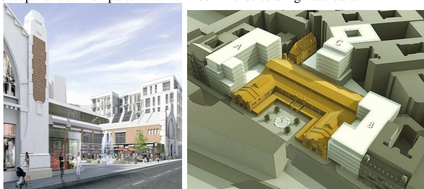
Figure 2 Hala Project visualisation prepared by APA Wojciechowski architects (Warsaw Gazette 2010)

The current owner of Hala Project is a privately owned company. Due to the special requirements for listed buildings set by the local conservation office work on the building revitalisation and site re-development has been delayed for a relatively long period of time. Demolition is not possible as the external elevations and main construction elements are to remain unchanged. The most recent project proposal includes the renovation of the old market hall, incorporating 10,000 sq m of new retail facilities. In addition, it envisages construction of approximately 200m high standard residential units in three new residential buildings with underground parking spaces adjacent to the retail scheme (Figure 2). The residential buildings are to be modern in character to offer architectural division to neighbouring buildings and the new apartments are to be offered for sale in an unfinished condition, except for common parts which will be finished to a high standard.