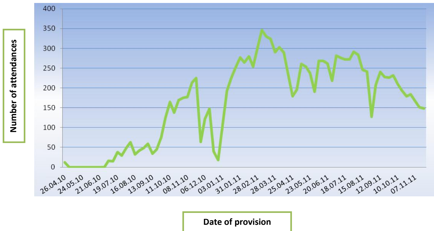
Figure 2: Total attendance across lifetime of Be Active