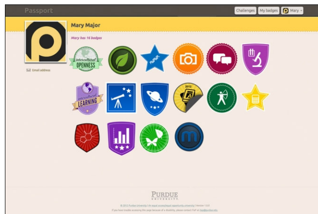
Figure 2: A Student's Badges Displayed in their Purdue University Passport Profile.

In addition to the development of the concepts of Open Badges, the Mozilla Foundation has also been developing the online infrastructure to support their use. The technologies used to implement Open Badges are Open Source, meaning that they could be integrated with all existing Virtual Learning Environment/Learner Management Systems, making the issuing of individual badges automatic in many cases. This 'Open' aspect would also allow learners to create portfolios of badges collected from a variety of sources and it ensures that security features have been built into the badges to make them difficult to 'forge'. Given this Open and distributed nature, it is appropriate that the communities around Massively Open Online Courses (MOOCs) are currently exploring Open Badges as a method of providing a secure way to recognise course completion. Partly for these reasons, in a report on the expected impact of a number of learning technologies, the UK's Open University concluded that the use of Open Badges has a 'High' potential impact, likely to be felt within 2-5 years (Open University, 2012). Open Badges have also been named as a key innovation for 2013 by the Harvard Business Review's Michael Schrage on his blog (Schrage, 2012). Some Higher Education institutions have already implemented Open Badge-based systems, such as Purdue University's Passport platform shown in Figure 2 (Tally, 2012).