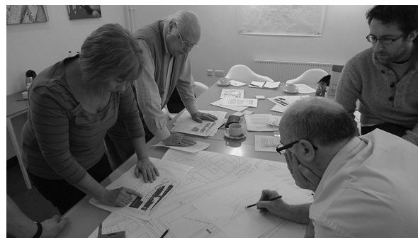
Fig. 2. People working around "A Road" map.

The emotional maps provided a temporal collation of the patients' and health professionals' experiences and concerns that could be shared with the alternate group. In the session in which public participants and health professionals first came together, representatives from each group used the map to explain their perspectives, tell stories and summarise their concerns for discussion.