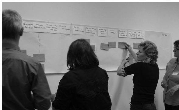
Fig. 4. Participants putting post-it notes on the emotional map.

Once design activities move beyond understanding the current situation to exploring future design proposals, they will inevitably require a wider, and perhaps less familiar, vocabulary. Well chosen representational artefacts can 'scaffold' participation, in the sense of providing supports