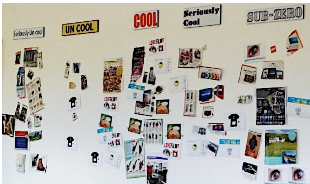
Figure 2: The 'Cool Wall' created by participants.