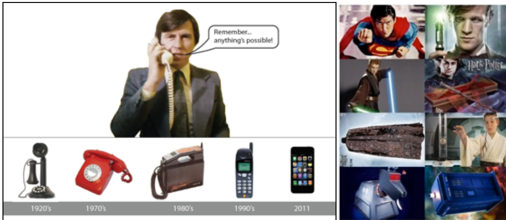
Figure 4: 'Anything is possible' display (left) and 'Blue Sky Joker Cards' (right).