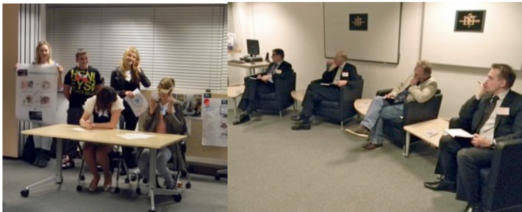
Figure 5: One of the young peoples' groups presenting their idea called "Tear free testing" (left) to four Dragons' (right).