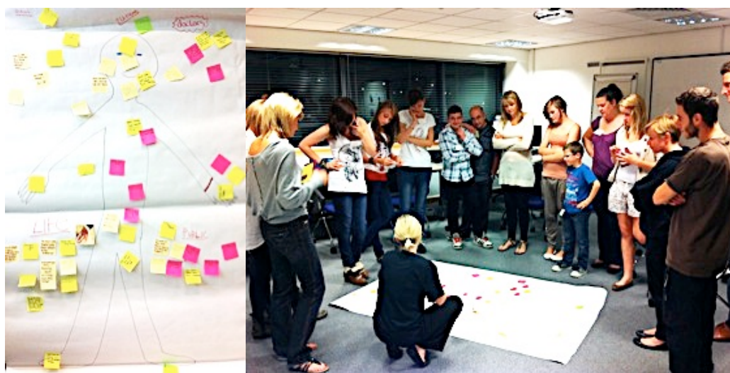
Figure 3: Bodymapping poster with post-it-notes (left) and group discussion at one of activity (right).