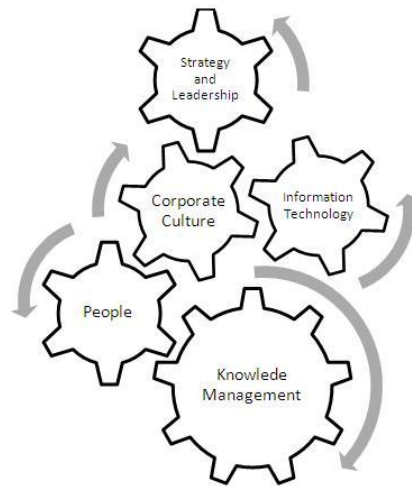
Figure 1: Synthesis of Knowledge Management Enablers in Organization.

emphasize on efficiency and productivity targets (Singh, 2000) that erodes employee well being, as a result of continuous surveillance by management over employees (Wallace et al., 2000). As a result, they are prone to traditional quantity versus quality dilemma, thus diminishing the 'service climate' (Little and Dean, 2006) or service culture in contact centres. Knowledge becomes a passive component in contact centres, and hence, the learning process, which is critical for better customer service. This demands an inquiry in today's contact centres, where the sole purpose of customer service operations to deliver information is lost.