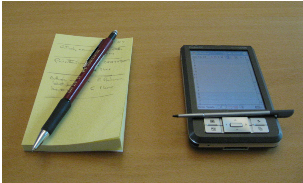
Figure 2. Two ways of planning and organizing customer visits. For some maintenance men the post-it note and pen provided the same functionality as a PDA would.

The problem does not seem to be that the information gathering methods of UCD or user research can not cover all the necessary aspects of users, but that the basic principle of UCD, always focusing on the actual user(s), guides designers and has guided the method developers to somehow forget the technology.