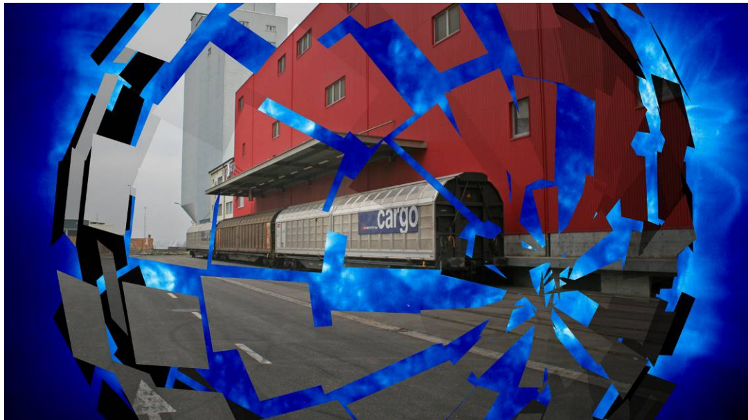
Fig 6. Playground: Playfully manipulating the sense of the “real”.

thus creating a different spatial framework. The experience of the real world through AR becomes part of another narration. The sense of the “real” and the sense of where one belongs to are playfully manipulated. The virtually created “second” frame of reference has its own coherent existence. It can be encountered in different places within the terrain. In addition to the terrain, the infrastructure of the park such as lamps, benches, and fences are part of the virtual model and altered in terms of scale, colour and shape. The scenario implementation balances out possible applications and interactions. At the stage of the experimental setting, user and staged terrain should be able to influence each other mutually (this part of our research is currently in progress). The user will interact with the scenario by walking around (altering position and walking pace) and looking around (altering view angle and orientation). The scenario will respond to the user by changing its appearance and character. For example, it will react to increasing or fading attention of the user (the duration of looking at something within one field of view) by growing its virtual extensions or reducing itself to a “normal” representation of the real; further, ground and virtual elements are distorted or enriched according to the user position. Playground orchestrates reality and virtuality by composing distance, forms, layers, motions and textures of the AR visualization.