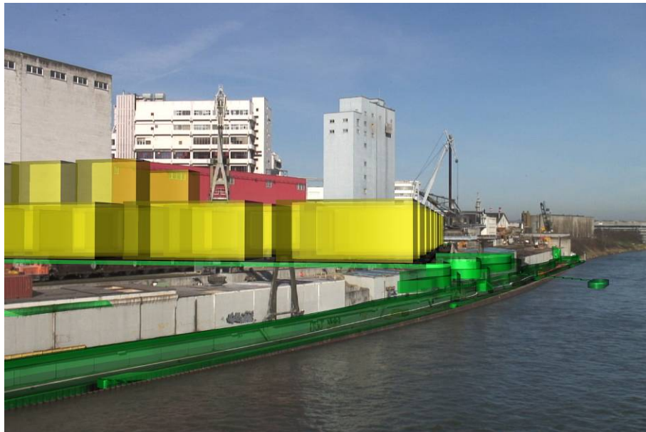
Fig 3. Archiviz: Investigation of the potential of Augmented Reality in urban design.

functions conducted (e.g. what combination of views is used for answering what question and for how long?). By means of observation from the outside (monitoring and recording of selected audiovisual perspectives, video recording of walk and behaviour as well as interview) and from the inside (interview reflecting individual perception, questionnaire to be filled out at the end of the tour) the behaviour of a group of laypersons and a group of experts (specialists from the department of urban planning, architects, planners) using the same system is surveyed. The group of laypersons is surveyed with respect to their understanding of the landscape architecture project, the group of experts with respect to the project assessment. At this stage, the project is still running. User tests will be conducted within the coming months. The analysis and documentation of the results will shed light upon the potential of the application of AR in comparison with architectural plans, as well as upon the potential of the realisation of the different themes in matters of content and design.