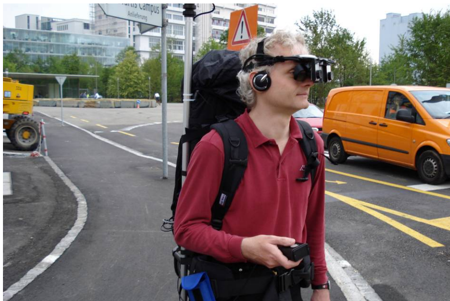
Fig. 1: lifeClipper2-user on walking tour in Basel.

lifeClipper2 investigates the potential and applicability of immersive outdoor Augmented Reality (AR). AR is the superimposition upon the user's perception of the physical world of virtual elements that are subtly located and woven into the real surroundings. AR technology is part of a rapid development that aims at invisibly integrating computers into our everyday life. Using AR, physical surroundings are extended and thus augmented by the presentation of virtual elements. While the term "Mixed Reality" describes a concept where virtual content and the real world intermingle, AR, as a submode of Mixed Reality, adds specific virtual elements to the physical world (Schnabel, Wang, Seichter, & Kvan 2007, 3–4). The AR-project lifeClipper2 offers an audiovisual walking experience in a virtually extended public space. A technical apparatus, whose development is part of the project (though not the subject matter of this paper), allows the users of lifeClipper2 to see and hear virtual elements in a staged outdoor area. lifeClipper2 explores the potential of AR for project visualization, urban planning, tourism, and perception studies in close collaboration with partners from different fields of research. lifeClipper2 is the continuation of the art project "lifeClipper", a free artistic interpretation of Augmented Reality, in the context of applied research (Torpus & Buehlmann, 2005 and Torpus, n.d.).