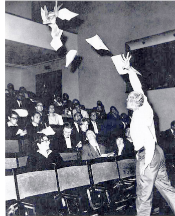
Dick Higgins, Danger Music No. 2 . Performance at Fluxus Internationale Festspiele Neuer Musik, Wiesbaden (1962).

By disjoining the physical link between author, gesture, object, use, and medium, Fluxus weaves an unprecedented heteroglossia that conjoins artists, spectators, gallery owners, investors, critics, the publishing industry and every other facet of the world conditioning the identity and life of the work. Often referred to as a "dynamic," the Intermedial method is discursive. Form emerges from exchange, implying a fundamental shift in scale. The work is not an object, nor even reducible to an author's individual's disembodied "intent". The scale of Intermedia is that of a network (Saper, 2001, XV).