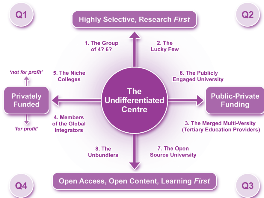
Figure 1: Higher education: A possible future scenario matrix

4 Although written in institutional terms the analysis might apply at the level of faculties, schools or departments.