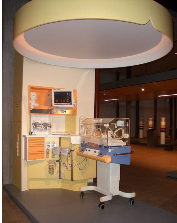
Fig. 3. Family Shell prototype

In the new design the child is placed central and the appliances have been pushed to the background. Family Shell provides the parents with some privacy in the patient area. Parents indicated that they wished they had more power to change the situation. Although this is hard to realize through design, an attempt is made by providing them a way to individualize the patient area.