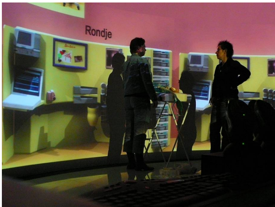
Fig. 2. Mixed reality set up

The participants felt stimulated and enabled to contribute to the evaluation process. In the beginning every participant had taken seat in the audience area and single persons needed to be invited to play out a scenario. However after a short time everybody had left his or her seat and entered the scene to participate in the discussion or point out elements on the screen.