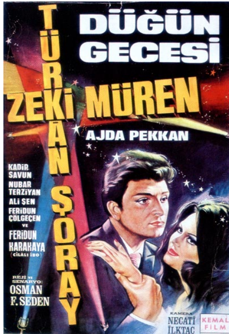
Fig. 8. Wedding Night (Düğün Gecesi) (Osman F. Seden, 1966)