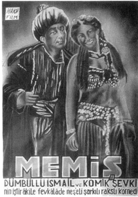
Fig 6. Memiş (its director and date is not known)

108). The blondes are mostly associated with the western world and values, whereas the brunettes are mostly associated with the rural Turkey and traditional, uncorrupted values. Exaggerations were mostly common in these kinds of applications. For example, a person with a short appearance in the film would cover the largest part of the poster. The greatness of romance within the film would be described with the slogans such as “a great masterpiece”, “most sorrowful love story ever”. Even the number of extras used in the film would be given as ten-thousands. The dubbing, technical qualities like colour or even the budget details were mentioned: “This film has been made with money paid in advance”.