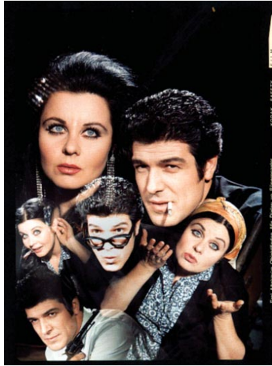
Fig 5. "Super-imposed" photographs of a film poster before the type added (Erol Ağakay)