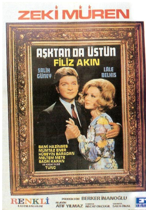
Fig 9. Even Superior to Love (Aşktan da Üstün) (Atıf Yılmaz, 1970)

looking" object. While the images of the stars are inside the frame as if they have fetishistic or imaginative values, star names were placed outside the frame due to the importance they had in reflecting the star identity. This "self-reflexive" attitude underlines the image of the star not as a character within the story of the film but as famous and popular singer-actor Zeki Müren (his name is even written by the use of star symbols in letter "i" and "ü"). Yeşilçam melodrama itself periodically stresses its own artifice or makes obvious that it is a fictional work by its variety show manner, the star text, or other connotations of being "fiction" that destroys its verisimilitude.