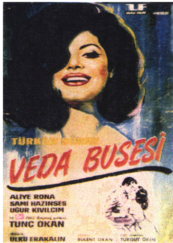
Fig 7. Farewell Kiss (Veda Busesi) (lk Erakalın, 1965). The "holy" characteristic of the star is mentioned by the exaggerated size of the head. The display of the star's body, especially the close-ups, is very important in the creation of the star's image. The close-up of a star's face is institutionalised as "the window opening to the soul" in (Akbulut, 2008, p. 103).

foreign films is the star system upon which the industry rises. The names of the stars which were graphically highlighted on the posters more than the title of the film reflects the content of the film to a large extent thanks to the expectations created with the influence of the stars' previous films and their representations within the media. These predictions and expectations are defined as the "star text" which is the career of the star image (Cullingworth, 1989, p.13) (fig 7). Trkan oray namely the sultan of Turkish cinema, the most popular female film star, is a good example of these definitions. Her talent in acting was supported by her off screen life. In 60s and 70s, oray played honourable and loyal wife roles and had principles known as the "oray Rules" which included the rejection of the kissing scenes or extreme eroticism. According to Kahraman (2001; Qtd. in Akbulut, 2008, p. 102), oray's image represented the integrity and morals of the people from the rural areas. Therefore, the posters of her films would be meticulously designed so as to receive approval from the public, whereas the posters of actors who could be considered as having a secondary status or of those who played in sex films were prepared by a different approach.