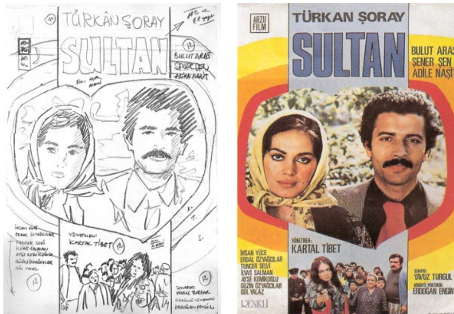
Fig 3. The sketch and original film poster for Sultan (Kartal Tibet, 1978) by Erol Ağakay. The colours and typefaces are mentioned as numbers on the sketch, the size and number of copies for each theatre is also mentioned.

disappears. Isn't that what must be fulfilled by the poster? To bewitch the eyes of the beholder" (Karakurt, 1997, p. 1). In these posters which are illustrated by the photograph or photographed by the illustration, the border between the photograph and the figurative and the realist illustration usually disappears. John Berger has emphasized that the photograph creates an effect on the audience with which they can easily identify whereas the illustration forms a surreal, idealized and exaggerated effect. The best example for this condition is the posters of Milky Way (Samanyolu) (Nevzat Pesen, 1959) and I Am So Lonely (Çok Yalnızım) (Mehmet Dinler, 1973) (fig 4). Illustrative representation / star illustration of the star image used in these posters create an idealized, supernatural and even divine effect. This condition may explain the usage of the same subject in the same plane in both photograph and illustration forms as seen in some posters and lobby cards.