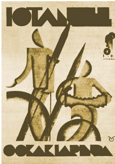
Fig 2. In the Streets of Istanbul (İstanbul Sokaklarında) (Muhsin Ertuğrul, 1931)

Like Yeşilçam melodrama's hybrid character, melodrama posters were also under the influence of German, French film posters at the beginning and in the later periods of Hollywood, Italian, Mexican, Indian and Egyptian film posters. The poster of In the Streets of Istanbul (İstanbul Sokaklarında) (Muhsin Ertuğrul, 1931) (fig 2), which is the first sound film of the Turkish cinema, clearly bears the geometrical and plain style of Art Deco, and it can be stated that it is visually more impressive than the film posters most of which were prepared by hand using primitive techniques even in the following years.