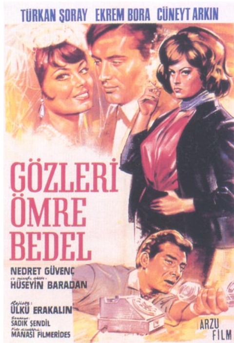
Fig 11. Her Eyes Worth a Life (Gözleri Ömre Bedel) (Ülkü Erakalın, 1964)

In Turkish cinema the films representing the tomboyish, masculine female characters aside with the contrasting feminine characters was very common between the years 1959-1965 (Biryıldız E., 1993; p. 13-14; Qtd. in Kirel, 2005, p. 281-283). These years were the times of industrialization, capital, the spread of consumerism and migration. Women could not continue to be themselves if they wanted to have man's jobs; in order to be equal and have the same rights with men; women had to wear their clothes. In all these moves the masculine character transforms into a lady, leaves her job and be the woman of her home next to her husband. Although these kind of films (and so the posters) seems liberating and going against the patriarchal rules of the society, in between the lines it was empowering the patriarchal ideology.