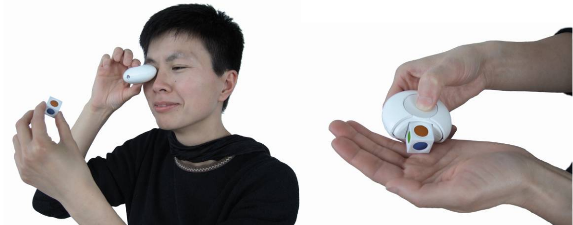
Fig. 2-3: Usage of the mobile EPR device

The EPR mobile device has a gesture-based product interface with an augmented reality lens display. Its movable shell can be rotated around the core. One quarter of the shell is lacking and gives access to the core that offers three functional sides: First, a wireless sensor and USB cable plug for data transfer; second, a small compartment containing the colored cursor cube; third, a lens with a camera on the opposite side (see Fig. 4-5). To access his patient record data, the user has to take the cursor cube out of the compartment and then look on it through the lens with one eye (like through a peephole, see Fig. 2-3). The camera displays the user's hand with the cursor cube inside and an overlay with the data structure. The cube's position and orientation is tracked. If it overlaps sensitive areas in the data structure, the user can press it between his fingers; overlapping works as a hover effect, while pressing the cube is "clicking" an overlapping data object. Thus, the product interface metaphor is consistent with the data structure of the software interface and provides an appropriate mapping of hardware and software interface.