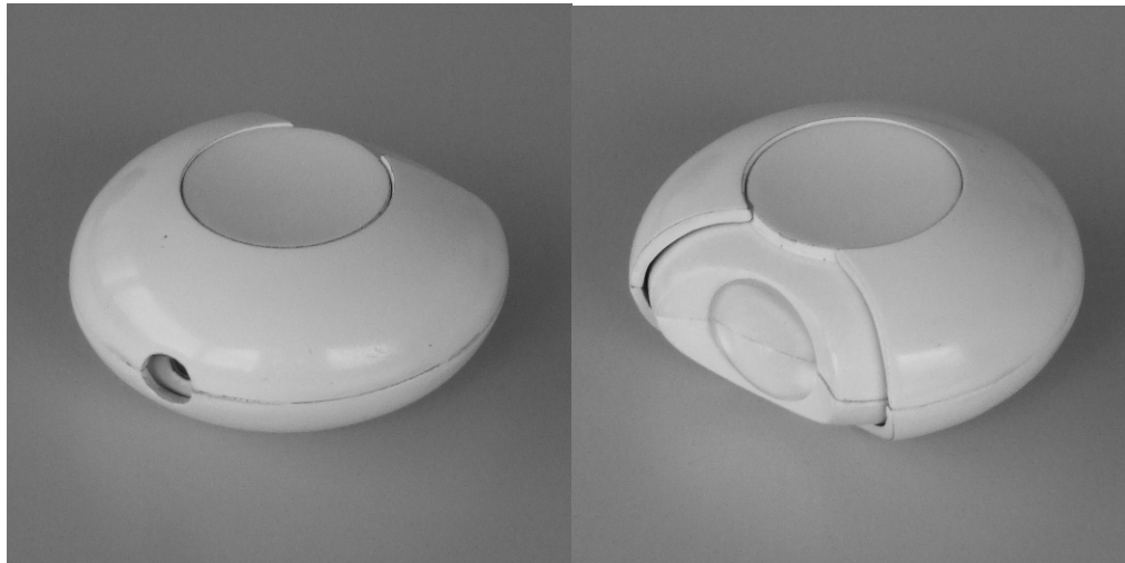
Fig. 4-5: Front- and backside of the mobile EPR device