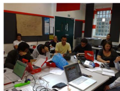
Fig 2. Students setting up their smartphones in a COP.

The core activity of the project is the creation and maintenance of a reflective Blog as part of a course group project. Additionally a variety of mobile friendly web2.0 tools are used in conjunction with the smartphone. The project investigates how the smartphone can be used to enhance almost any aspect of the course. To minimise the level of technological load and scaffolding required by the students (and lecturers) the project uses the smartphone within a select range of activities (see the following diagram and table that attempt to illustrate the alignment of these activities with the projects underlying social constructivist pedagogy. Students create accounts on free web2.0 sites and then invite their lecturer and peers to collaborate within these environments. The institutional LMS (Learning Management System) is used to provide scaffolding, tutorials and initial guidance in setting up their web2.0 environments from the technology steward and the course lecturer. For a fuller description, there is an interactive online version of the project concept map available at: http://ltxserver.unitec.ac.nz/~thom/mobileweb2concept2.htm or mirror at http://homepage.mac.com/thom_cochrane/MobileWeb2/mobileweb2concept2.htm .