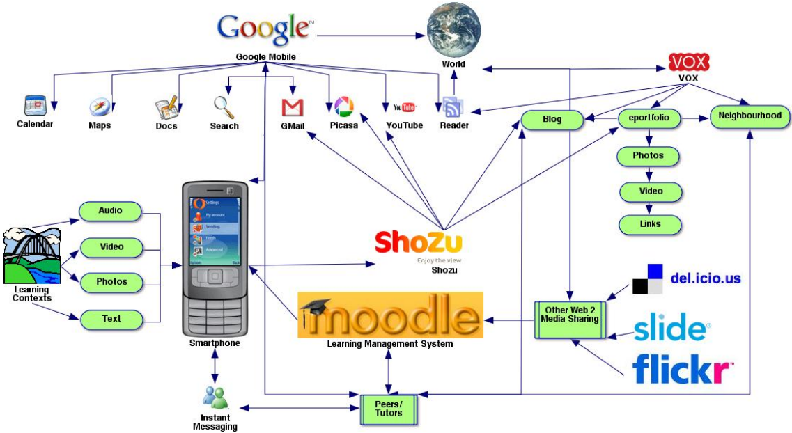
Fig 2. Mobile Web2 Concept Map.

there is an interactive online version of the project concept map available at <a href="http://ltxserver.unitec.ac.nz/~thom/mobileweb2concept2.htm">http://ltxserver.unitec.ac.nz/~thom/mobileweb2concept2.htm</a> or mirror at <a href="http://homepage.mac.com/thom_cochrane/MobileWeb2/mobileweb2concept2.htm">http://homepage.mac.com/thom_cochrane/MobileWeb2/mobileweb2concept2.htm</a>.