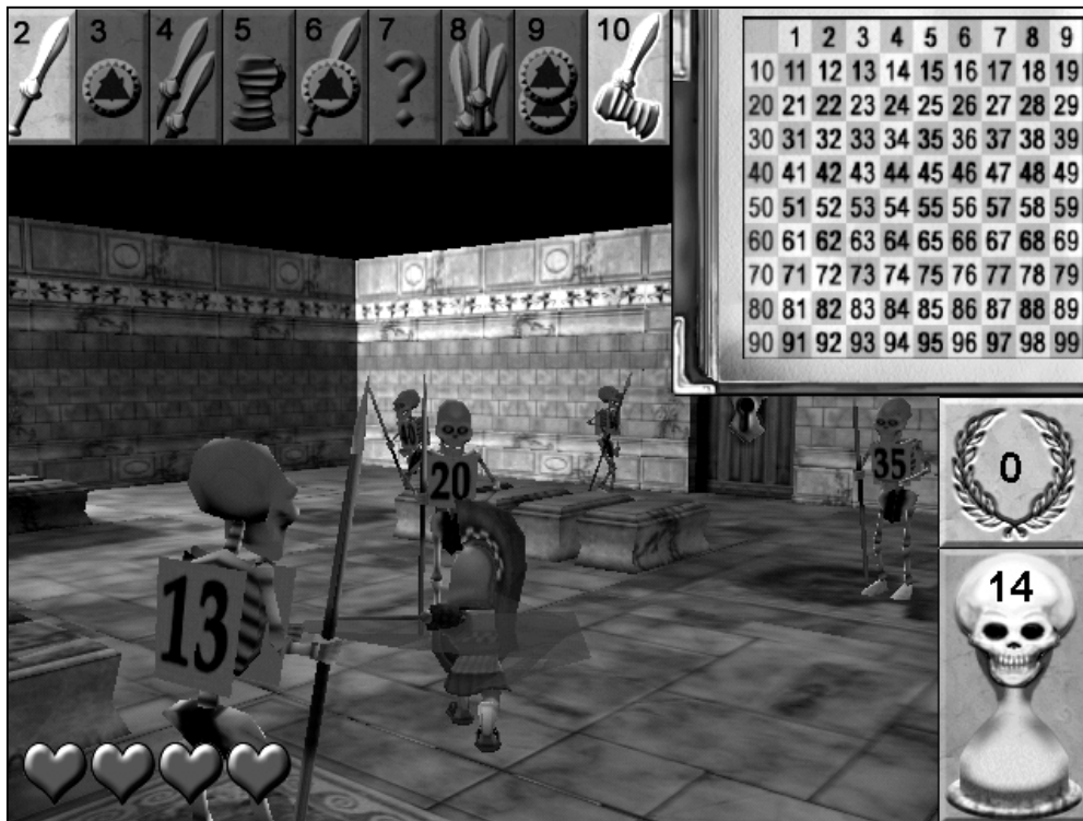
FIGURE 3. A screenshot from the intrinsic version of ZOMBIE DIVISION.