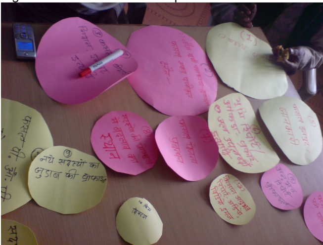
Figure 3: A chapatti diagram discussion

Having identified some stories, it was important to establish an understanding of the relative priorities associated with different pieces of functionality. To facilitate these discussions, we used the participatory rural appraisal method of ‘chapatti diagrams’. In this technique, circles of coloured paper (analogous to chapattis), are cut out for each item under consideration. The relative sizes of the chapattis represent the order of priority attached to different ideas, and thus facilitate discussion of relative priority. Figure 3 illustrates the technique in action.