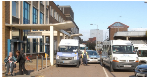
Figure 1: Main Outpatients building entrance, A Road

the engineer who wrote this report, agreed to contribute his expertise to the design activity.