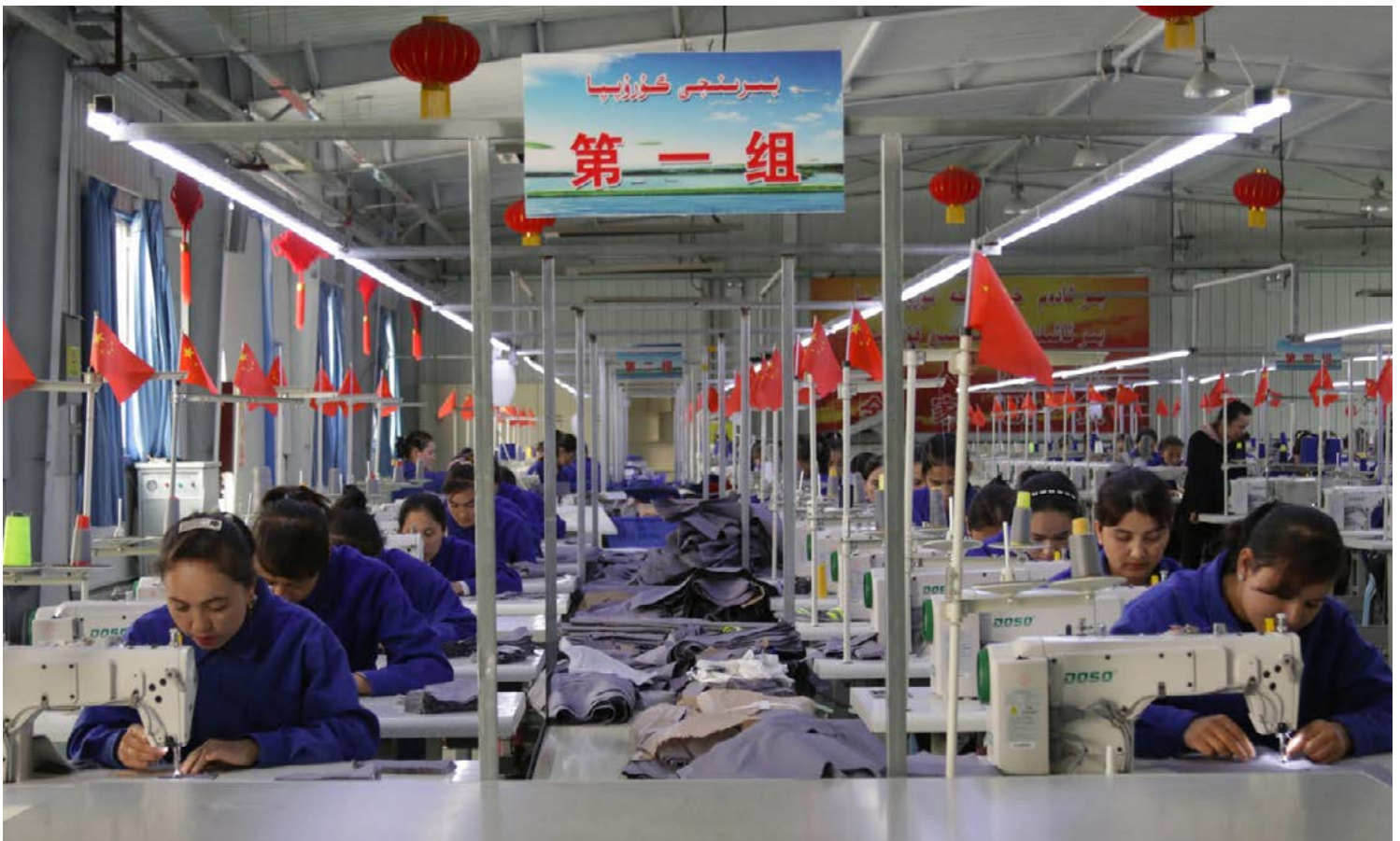
Uyghur women work in apparel factory.

The PRC claims that these labor transfer programs are part of a national campaign for “poverty alleviation.” However, the programs involving Uyghurs and other minoritized citizens operate differently from other “poverty alleviation” programs throughout China, because for individuals from the Uyghur Region, the constant threat of internment makes refusing the state-sponsored work placement impossible. Labor transfers are deployed in the Uyghur Region within an environment of unprecedented fear and coercion. Refusal to participate in any government programs, such as labor transfers, for reasons perceived to be religious in any way, is viewed as equivalent to aligning oneself with the three evils – separatism, terrorism, and religious extremism – and thus anyone who refuses to work or attempts to walk away from their job, risks internment or imprisonment. Therefore, the programs are tantamount to the forcible transfer of populations, forced labor, human trafficking, and enslavement by international definitions and protocols.