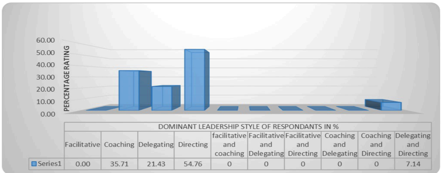
Figure 2: Percentages Rating vs. Dominant Leadership Style of Respondents