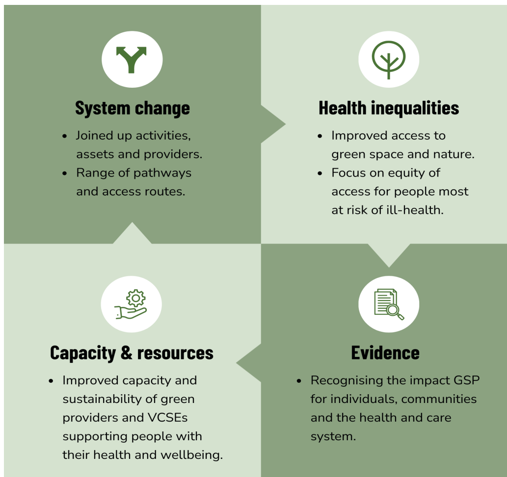
Figure 2: Four principles in the GSP vision for South Yorkshire

Where good links have been established with local link workers, referral pathways have been well-embedded, and this has driven referrals to VCSE organisations. Where this hasn't been as successful, VCSEs are using resource and capacity to find alternative recruitment opportunities such as social media and use of word-of-mouth. The proposed pathways for GSP at the start of the project (see Figure 3) have largely been realised in practice. Some pathways have been predominant in different regions, but less successful in others. The reason why some pathways are more successfully embedded in one part of the region than others is less well known and may require further evaluation.