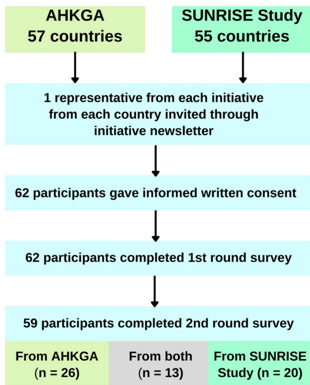
Fig. 1 Flow chart describing recruitment of participants. AHKGA, Active Healthy Kids Global Alliance; SUNRISE, International Surveillance Study of Movement Behaviours in the Early Years

Mann–Whitney U tests to assess the statistical significance of median differences in responses between LMICs and HICs. Second, we considered potential median differences in responses between the initiative which participants represented (SUNRISE or AHKGA or both). The significance of median differences in responses between initiatives was tested using Kruskal–Wallis Tests. Jamovi ( www.jamovi.org ) was used for statistical analyses and a p level of 0.05 used to define statistical significance.