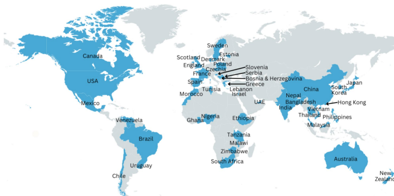
Fig. 2 Countries with participant(s) in the present Delphi study

behaviours and NCD prevention, and greater use of movement behaviour guidelines and strategies at national levels. The other priority items were greater awareness of the linkage between the movement behaviours and child and adolescent development, and better partnerships at national level between those responsible for surveillance and those with expertise in movement behaviour measurement. The need to improve human capacity in movement behaviours (education, training, research experience) reached 93% agreement.