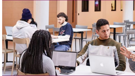
Learning, Teaching and Assessment Framework 2022-30