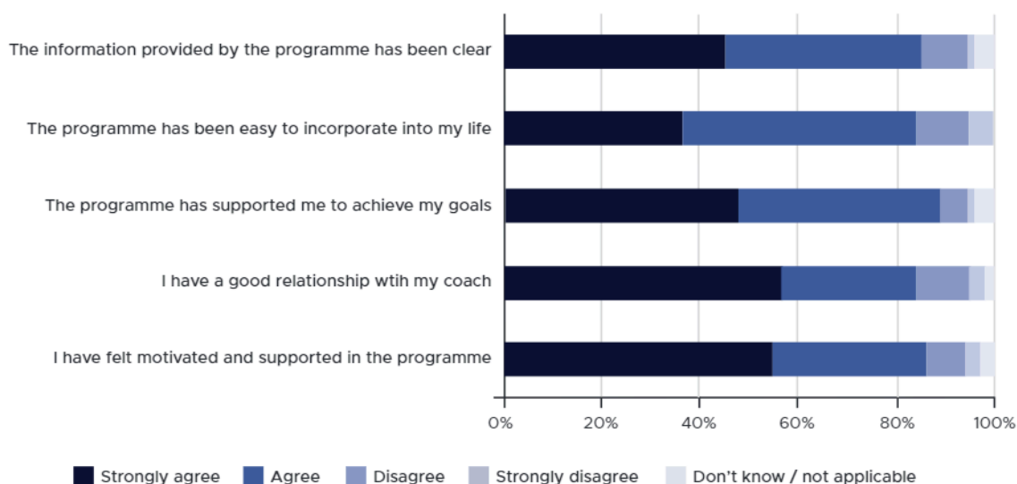
Figure 3. Participant experience of the food reintroduction phase

Perceived negatives of this phase were provided by 60 participants and included: a need to plan, purchase and prepare food (n=23); increases in weight / anxiety about weight regain (n=19); concern about the level of motivation required to stick to the programme (n=9); anxiety over what food to eat (n=7); and the amount of support / guidance provided (n=6). When asked if they were confident about the types of food to