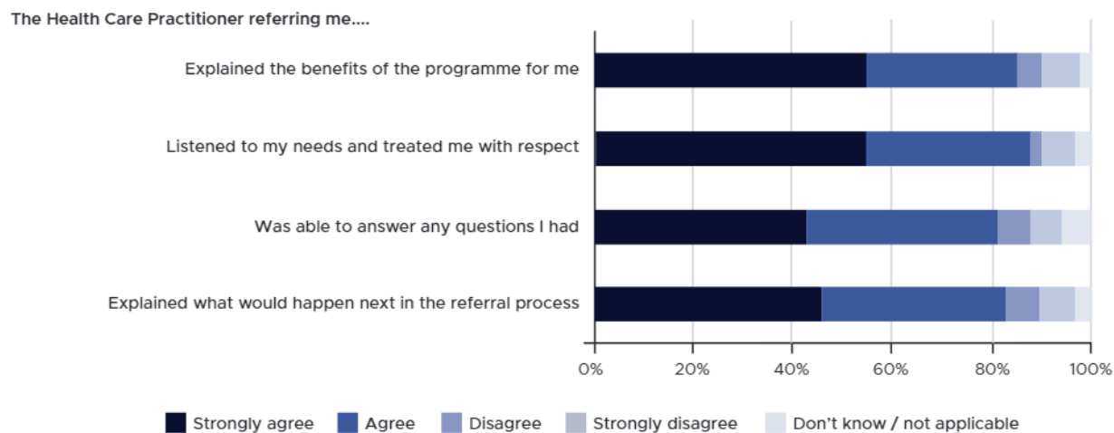
Figure 1. Referral process

information, and the need to be able to contact the provider more easily. The desire to receive a phone call, rather than just app messages or chat, was highlighted by 5 out of 25 participants from one of the digital providers.