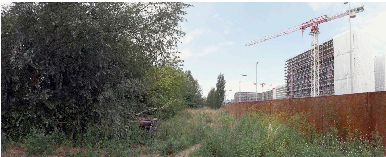
Figure 1: Chausseestrasse 2014, Digital composite panorama 4m x 1.5m

Lines of Resistance consists of two large photographic panoramas of undeveloped areas of the death strip, which is the former German Democratic Republic patrolled zone on the border of East Berlin. A video filmed at the Berlin Wall Memorial site is also part of this body of work. To make work, my process often involves getting access to a restricted area, to have a look, to be able to see or find out more, and to learn something by doing so. I use a camera as the vehicle with which to look closely and from which to have a reason to look over a period of time. When I describe my art practice in this way, it seems to make sense why my doctoral research now centres on surveillance. Surveillance, though, suggests someone in a position of power, with access and authorisation to look alongside the technology or means to enable that. As an artist I do not have that, but my research involves getting access to look, at surveillance, with adapted use of technology and sometimes with the authorisation to do so.