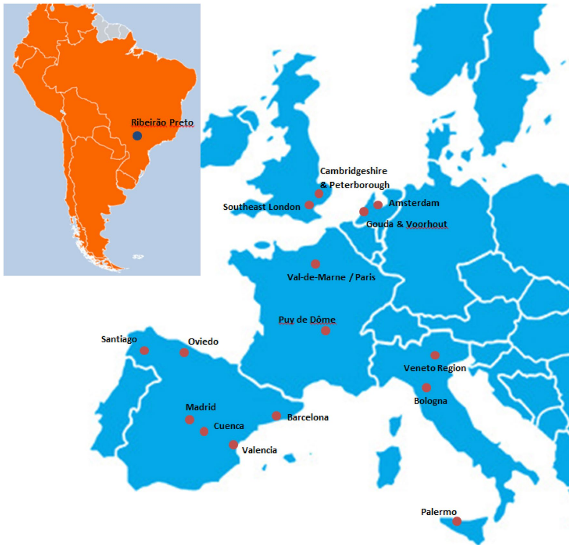
Fig. 1 Map of EU-GEI settings for the incidence and case–control Work Package

added data from the Veneto region, Italy, collected as part of an earlier study [the Psychosis Incident Cohort Outcome Study (PICOS); 2005–2007], but with sufficiently similar methods to be pooled with that collected for this study. The incidence sample comprised 2774 individuals with a first episode of psychosis. Of these, 1519 were approached, and 1130 were consented and assessed (41% of the total incidence sample). Reasons for non-participation among cases who were approached were refusal to participate, language barriers, and exclusion after consenting as they did not meet the age inclusion criteria. In addition, 1497 controls were recruited and assessed.