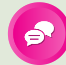
Create and fund a nationwide advice service