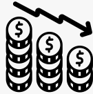
Inadequate income & insufficient state benefits