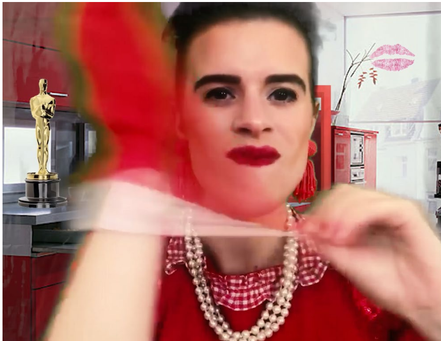
Figure 3. Still from The Kitchen It's Us!

I communicated the role of the Domme/Star through the ways in which she engaged with the space and audience as well as her relationship to food in The Kitchen . Barbara Kirshenblatt-Gimblett (1999) states that “food, and all that is associated with it, is already larger than life. It is already highly charged with meaning and affect. It is already performative and theatrical” (Kirshenblatt-Gimblett, 1999, p. 1). I perceived a connection between the understanding of the performativity of food and the theatricality of the Domme figure. The Domme is also “highly charged with meaning and affect,” and aligns with Bobby Baker’s justification of how in her performance practice, food refers to her “role as a woman as a sort of provider or