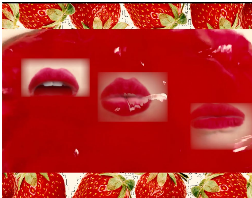
Figure 5. Still from The Kitchen in It's Us!

Jenny Sundén argues that gender, femininity in particular, is something that is “fundamentally technological, and hence broken ” (2016, p. 23, emphasis in original). In other words, Sundén suggests that femininity is a construction and thus likens gender to digital technology in that it is ultimately destined to have moments of disruptive glitching and failure. My DIY aesthetic in The Kitchen points towards Sundén’s conclusion by portraying my image of femininity as often incomplete or broken in some way. As can be seen from Figure 4, I edited the footage together so that it purposefully cut off sections of my image, such as the top of my head. This emphasised to my audience how my digital image, along with my surrounding virtual environment, was artificially created, and therefore, always at risk too of failure 7 .