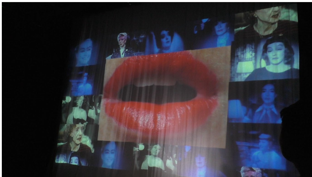
Figure 1. Image of projection on curtain from It's Big Mouth!

the aesthetic and as part of reclaiming these later performances. I used this aspect of vidding to find out what feminist potential might be possible in this alternate, digital reality that I created within It's Us! . Moreover, I employed the creative methodology of vidding throughout my practice, by re-organising and editing old footage, to facilitate a refreshed and disruptive interpretation for the spectator and enhancing that disruption through my own contemporary filmed footage.