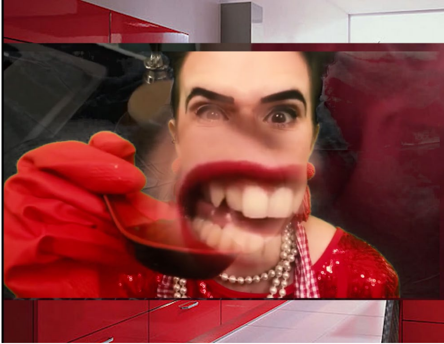
Figure 2. Still from The Kitchen in It's Us!