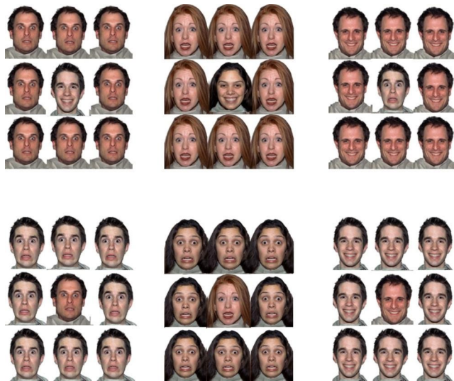
Fig. 1 Examples of stimuli used. The examples depicted clockwise from top left are an incongruent happy trial, an incongruent happy trial, a congruent happy trial, a congruent fear trial, and a congruent fear trial

Attentional control was measured using the Attentional Control Scale (ACS; Derryberry & Reed, 2002). The ACS requires participants to indicate how often they experience the effects of attention described in 20 statements such as my concentration is good even if there is music in the room around me, and I can quickly switch from one task to another. Participants self-ratings are recorded using a four-point Likert type scale with each numerical anchor point described by a verbal descriptor ranging through: almost never, sometimes, often, and always. Eleven of the ACS items are reverse scored. In the present study the ACS (sample mean = 49.5, SD = 9.2) had a good degree of internal consistency (Cronbach's \alpha = 0.86 ).