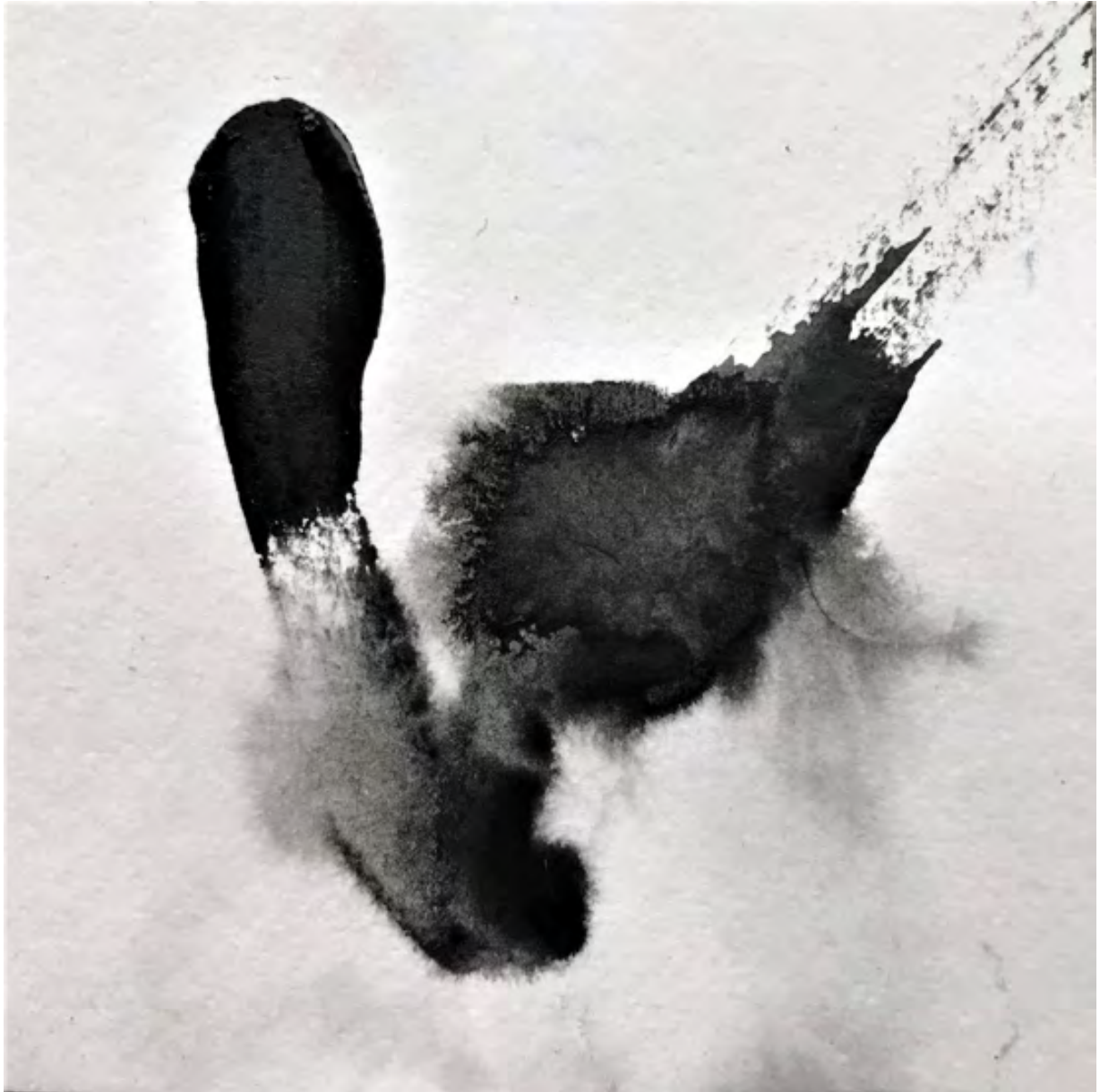
Dive, Alison Churchill, December 2020