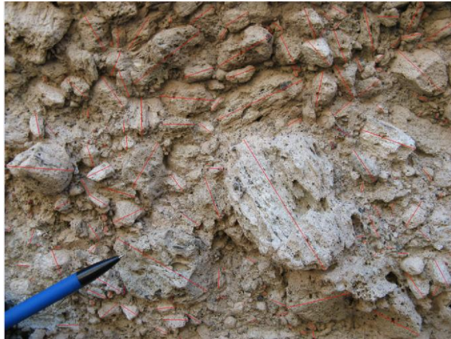
Figure S2: Poris cross stratified pumice block facies image following point counting and long axis measurement of 200 random clasts using JMicroVision software. Red lines show locations of measurements taken.