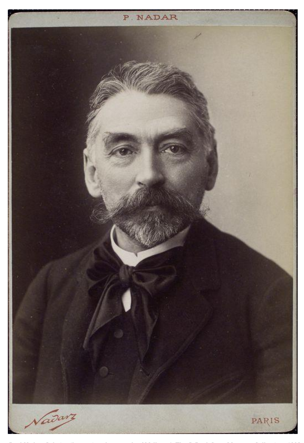
Paul Nadar, Gelatin silver-print photograph of Mallarmé, The J. Paul Getty Museum Collection, 1890.