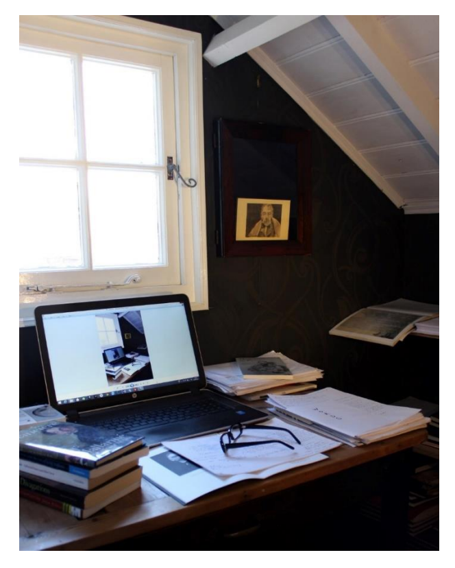
M.B. O'Toole, Reading Mallarmé, Digital photograph, 2015.

This digital portfolio of artwork reflects the order of the chapters in the written part of this thesis. The introductory folder provides an outline of the contents and images relating to the introduction. Folders One to Six are conceptually linked to Chapters One to Twelve. Folder Seven provides documentation of dissemination of practice as research in the form of exhibition and publication.