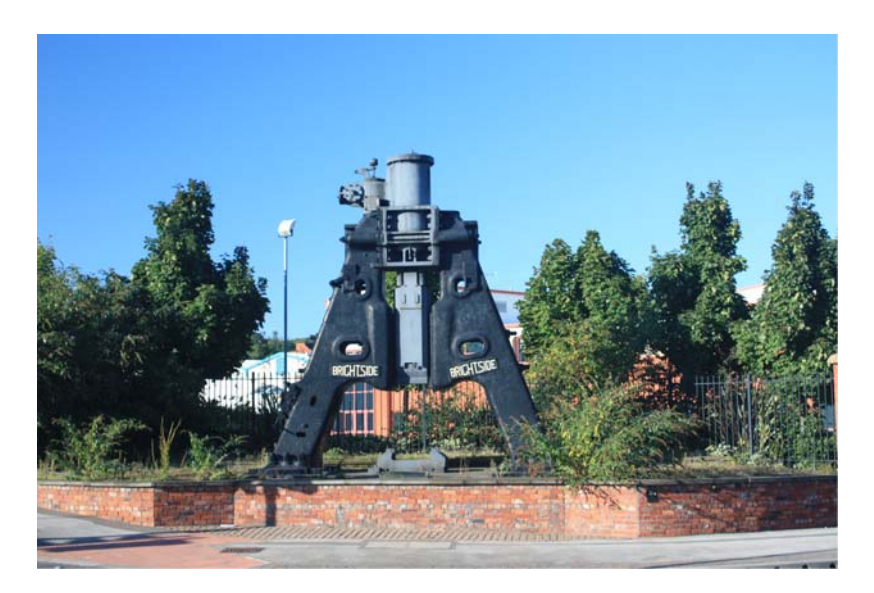
Figure 2. A preserved drop-hammer in the Brightside area of Sheffield. This file is licensed under the Creative Commons Attribution-Share Alike 3.0 Unported license. https://commons.wikimedia.org/ wiki/File:Drop_Forging_Hammer_in_Brightside_Sheffield_MG_2185.JPG