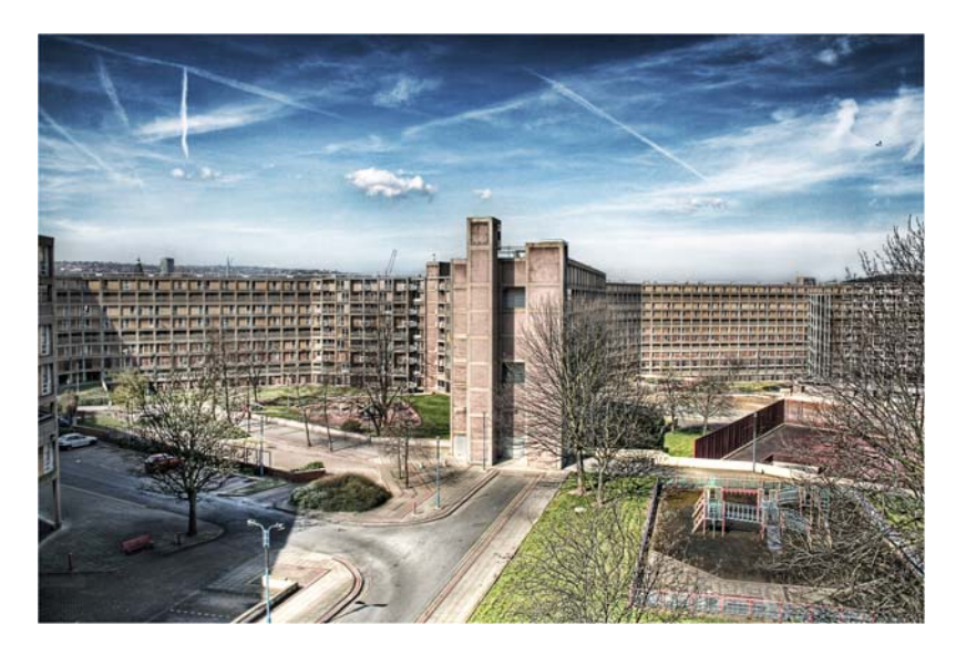
Figure 4. Sheffield's Park Hill flats, a city landmark since their completion in 1961. Image reproduced through Creative Commons Attribution-Share Alike 3.0.