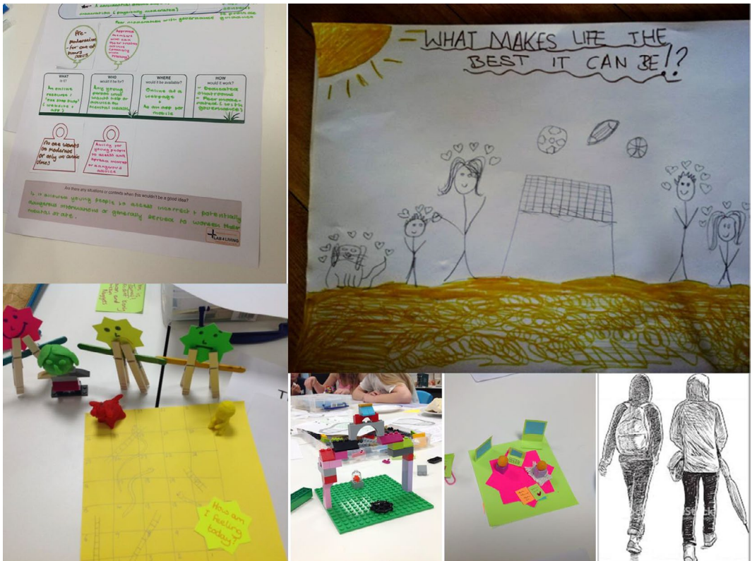
FIGURE 2 Creative exercises to provide a range of ways to discuss and make sense of an abstract topic such as ‘thriving’. Clockwise from top left (a) worksheets, (b) free drawing, (c) storytelling walks, (d) modelling with paper (e) modelling with building blocks (f) prototyping

The workshops included exercises and discussions (see Figure 2). In each workshop, a range of stationery and modelling materials (pipe-cleaners, soft clay and construction bricks) were provided to support the co-researchers to express their ideas and encourage engagement. The co-researchers created avatars and critiqued newspaper headlines to explore identity, consider the different ways society may portray young people and explore issues outside their direct