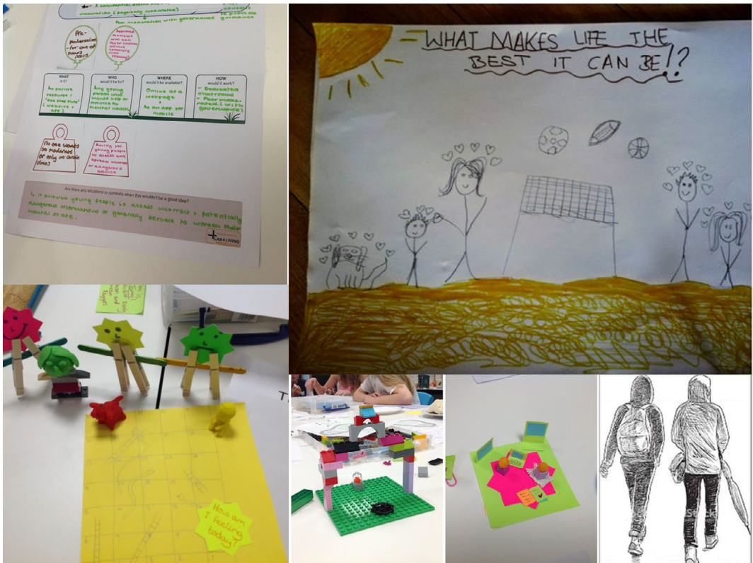
FIGURE 2 Creative exercises to provide a range of ways to discuss and make sense of an abstract topic such as ‘thriving’. Clockwise from top left (a) worksheets, (b) free drawing, (c) storytelling walks, (d) modelling with paper (e) modelling with building blocks (f) prototyping

The workshops included exercises and discussions (see Figure 2). In each workshop, a range of stationery and modelling materials (pipe-cleaners, soft clay and construction bricks) were provided to support the co-researchers to express their ideas and encourage engagement. The co-researchers created avatars and critiqued newspaper headlines to explore identity, consider the different ways society may portray young people and explore issues outside their direct