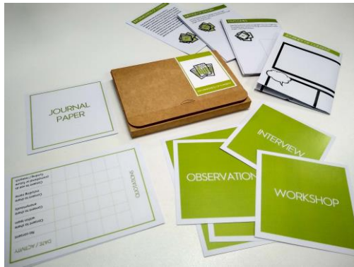
Figure 6 Contents of the Informedness of Consent section of the Ethical Roadmap