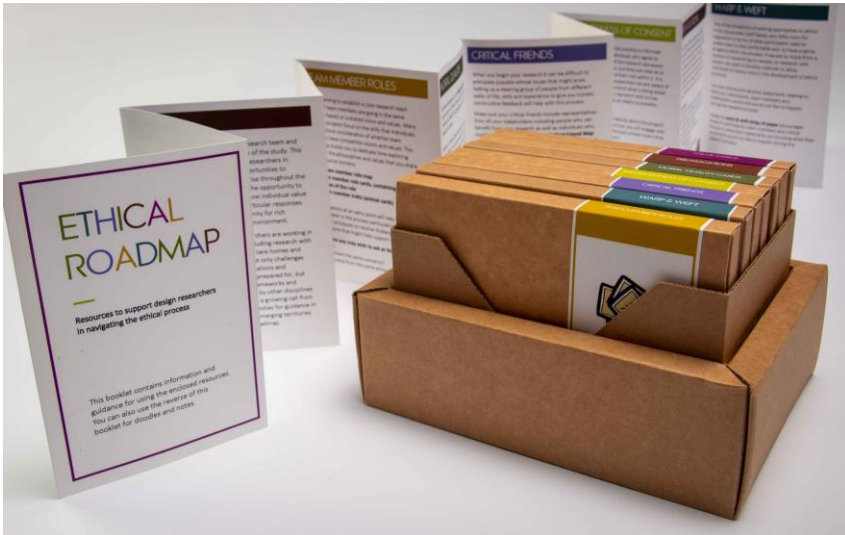
Figure 4. Ethical Roadmap box containing individual packs of resources/activities.