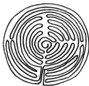
Figure 1 Reflective Diary excerpt – rigidity of frameworks

Diary Reflection: "If an analogy of a roadmap is taken a stage further, perhaps we can think of this as a process of reflection or meditation. The important element is reflecting, recognizing that there are multiple ways to reach the final destination – something far more akin to situated ethics, to Dewing's work. There are dangers though. Without any guidance or value system this could simply reinforce and unhelpful or unethical way of being."