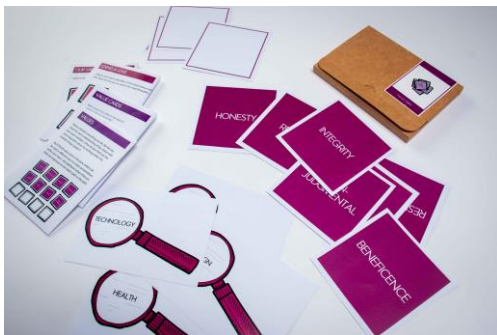
Figure 5. Contents of the value cards component of the Ethical Roadmap