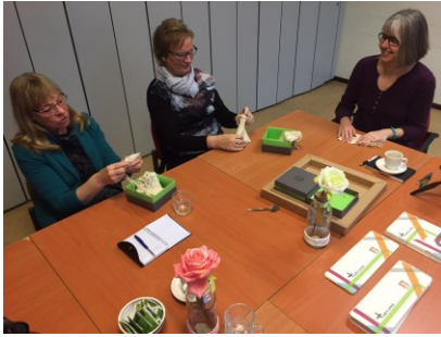
Figure 2: Co-design workshop using the exhibition in a box methodology.