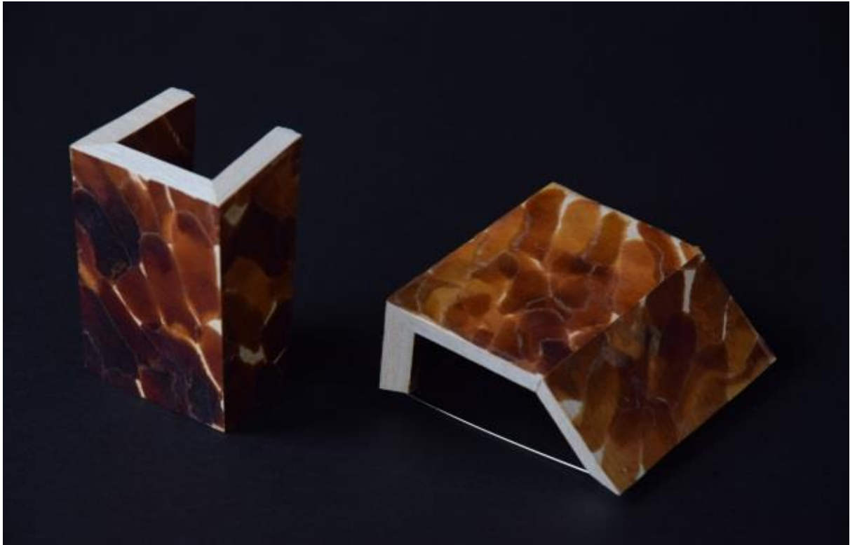
Vanitas I & II (brooches), 2017

Apple peel, balsa wood, stainless steel, silver, 6.8 x 4.6 x 4.0 and 7.5 x 7.3 x 3.3cm