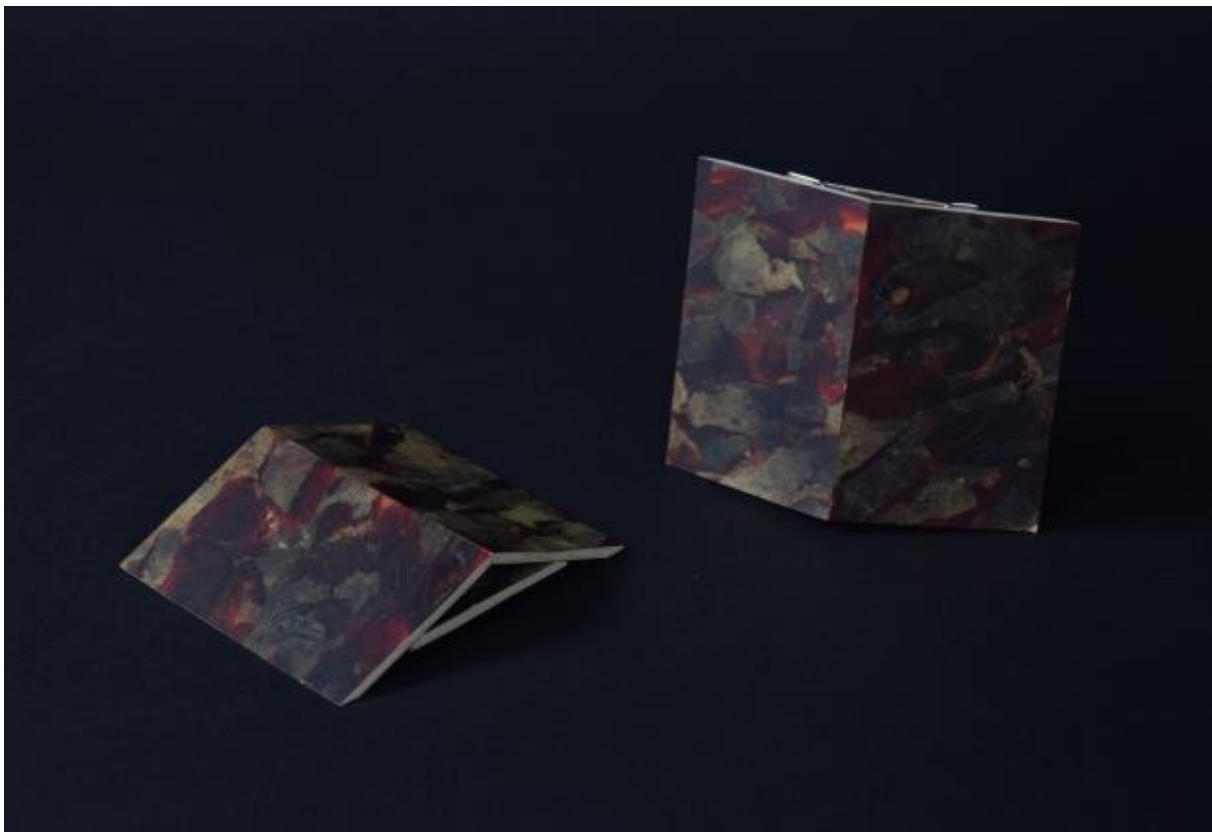
Vanitas III (brooches), 2017, beetroot peel, balsa wood, stainless steel, 7.4 x 8.6 x 1.9cm

Apple peel, balsa wood, stainless steel, silver, 6.8 x 4.6 x 4.0 and 7.5 x 7.3 x 3.3cm