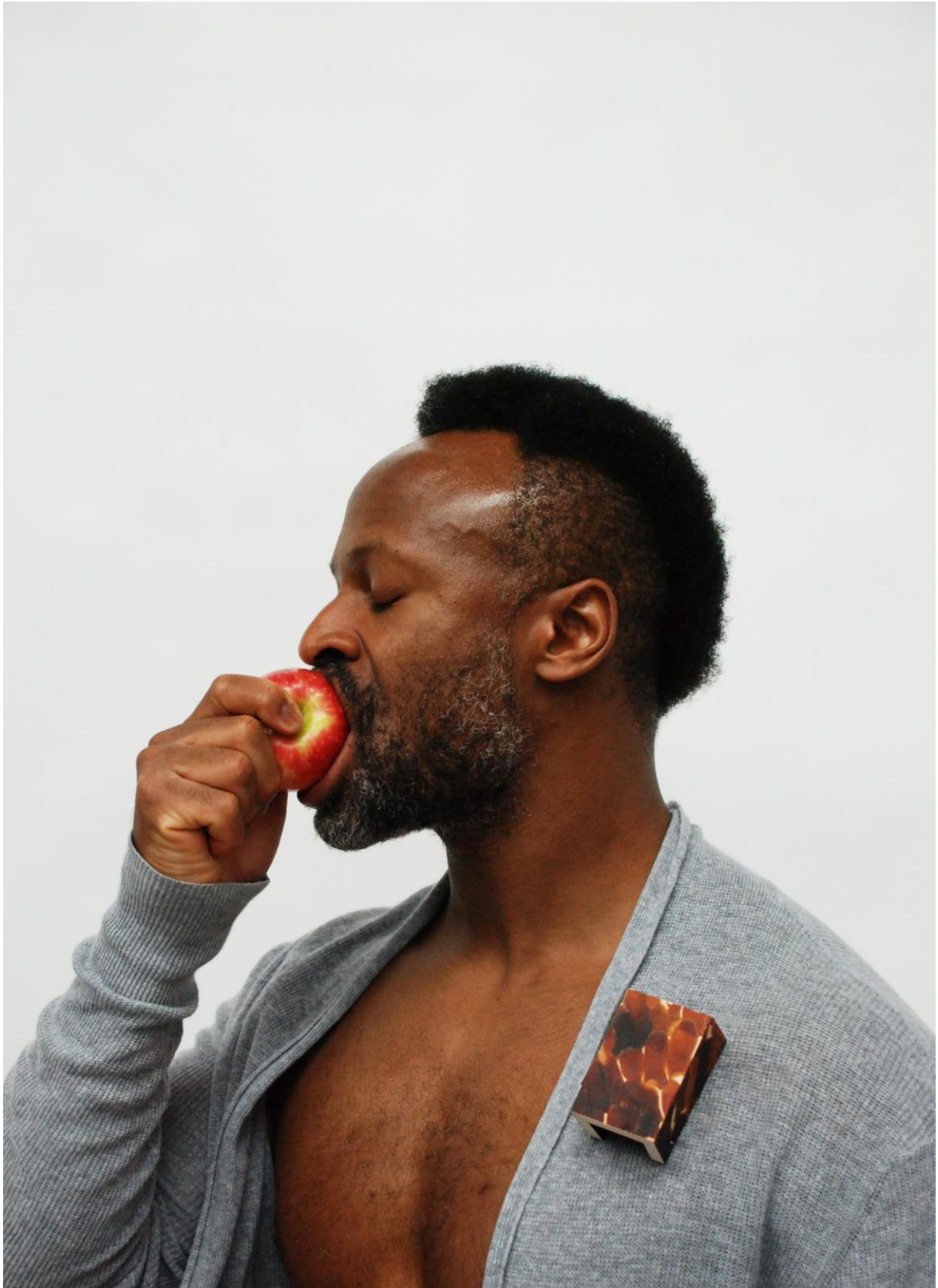
Vanitas II (brooch), 2017, apple peel, balsa wood, stainless steel, silver, 6.8 x 4.6 x 4.0cm