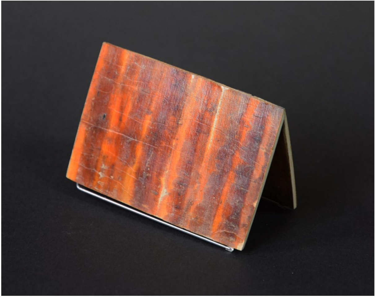
Vanitas VI (brooch), 2017, carrot peel, balsa wood, stainless steel, 7.5 x 3.8 x 4.7cm