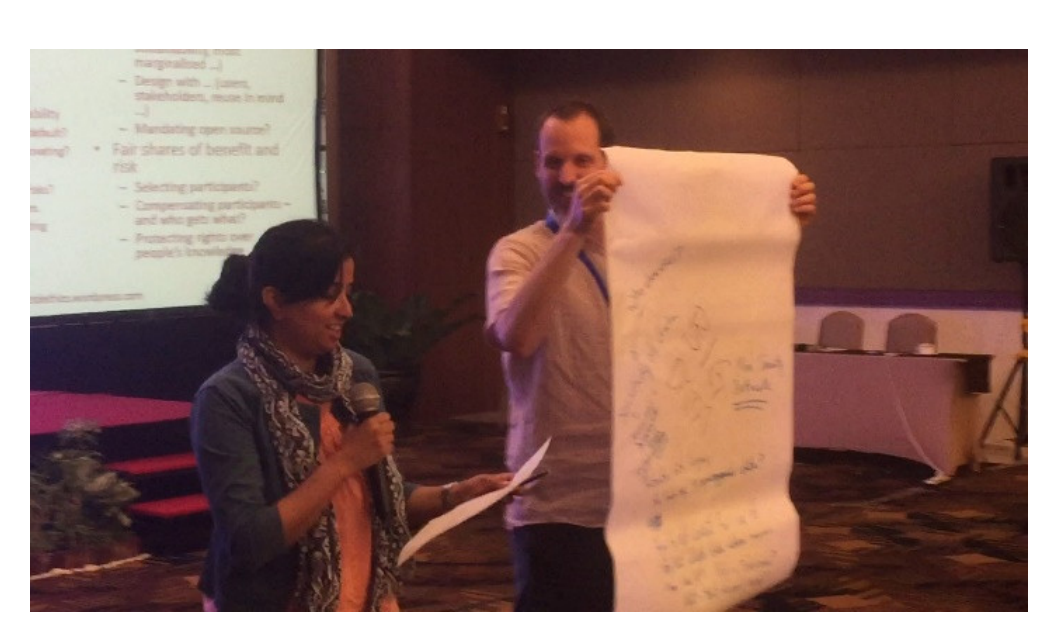
Reporting back from group discussions