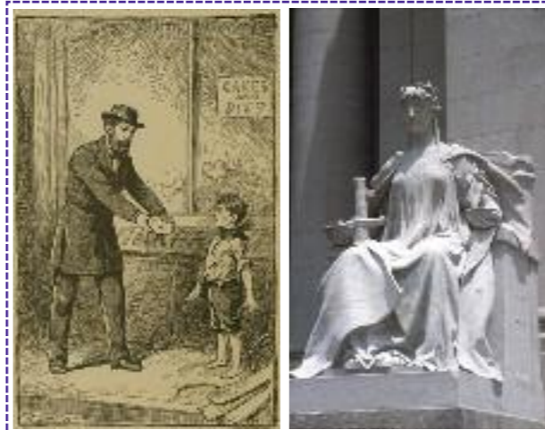
(left) Source Needham, Geo C. "Street Arabs and Gutter Snipes" (1884)

Equity/social justice: We should create a fairer distribution of social goods as a matter of duty.