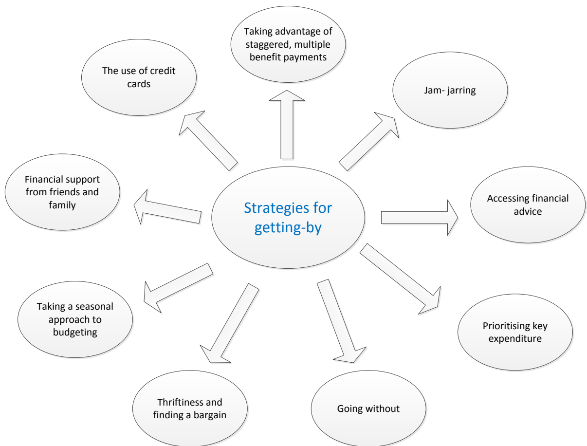
Figure 3. Strategies for 'getting-by'