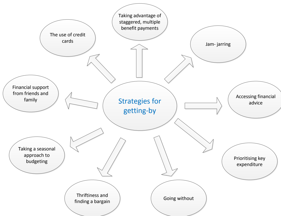
Figure 3. Strategies for 'getting-by'