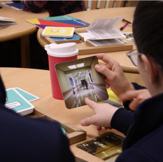
Figure 3: Aberdeen June 2018