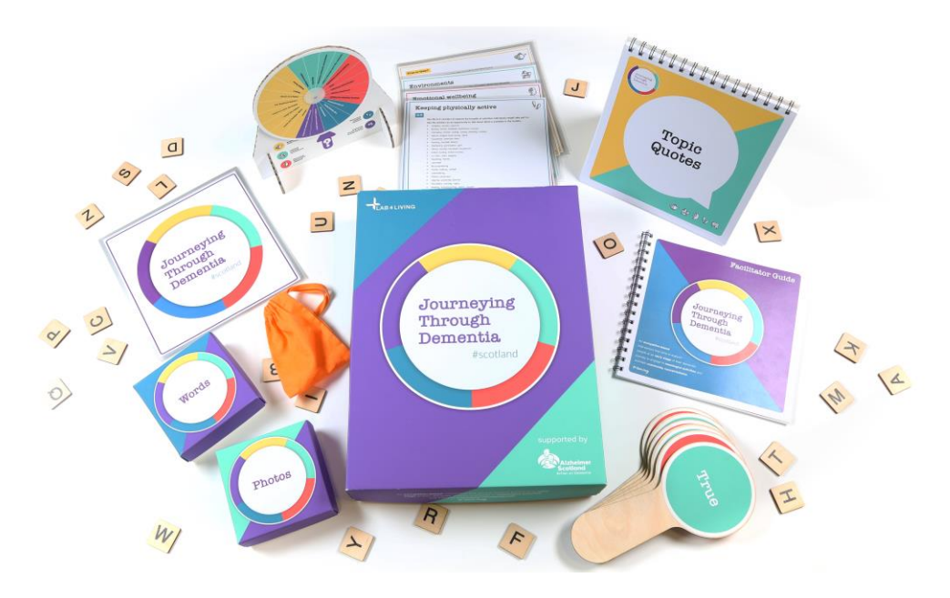
Figure 7: Demonstrator Sit Pilot Kit 2019