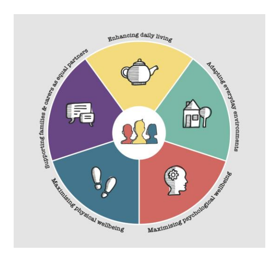
Figure 10: CPCS policy themes

'It is so great to have a resource we can use to move towards early intervention and demonstrate we are implementing the CPCS policy.' (Participant, Fife)