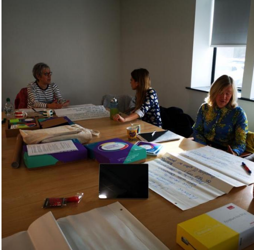
Figure 5: Fife November 2018