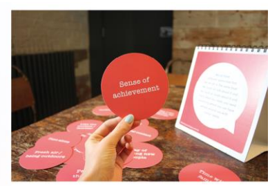
Figure 8: Demonstrator Site Pilot Kit Elements 2019