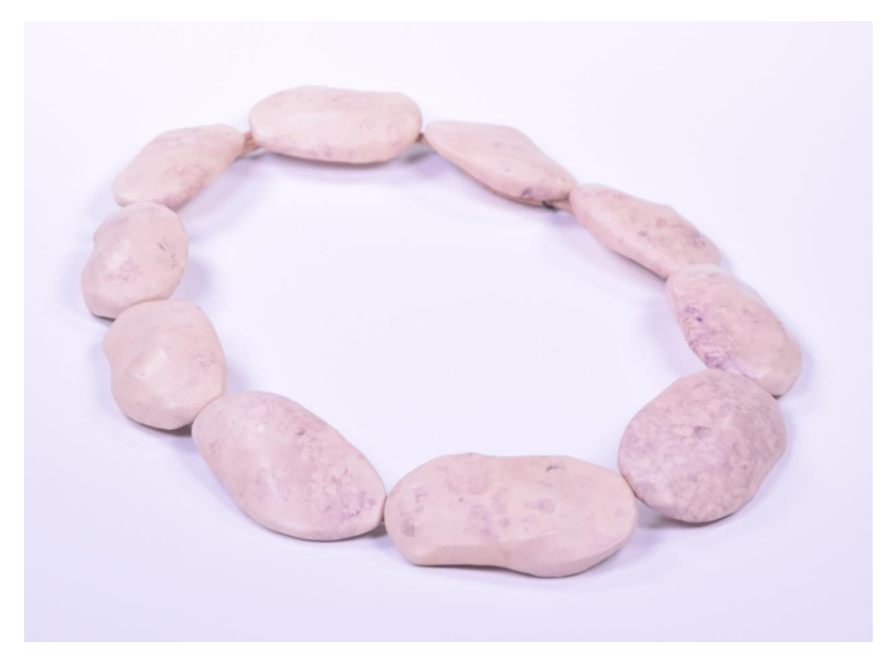
Tongues (neckpiece), 2018

Mango stones, blackberry dyed and moulded leather, stainless steel, iron, bamboo, 35 x 30 x 3.2cm