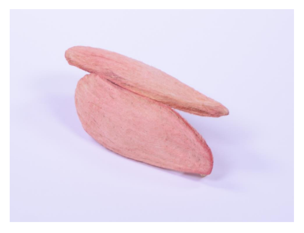
Split-tongue (brooch), 2019

Beetroot dyed mango stones, stainless steel, bamboo, approx. 10.5 x 6.6 x 5.2cm