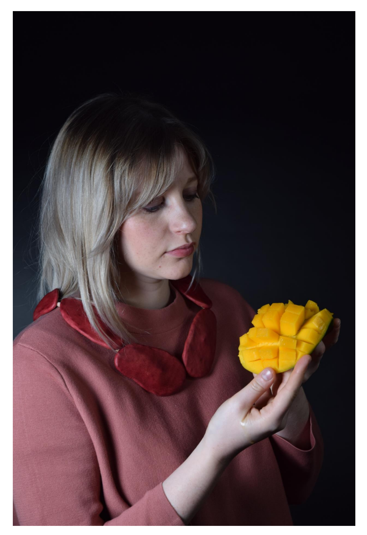
Tongues (neckpiece), 2018

Mango stones, beetroot dyed and moulded leather, stainless steel, iron, 29 x 26 x 3.5cm