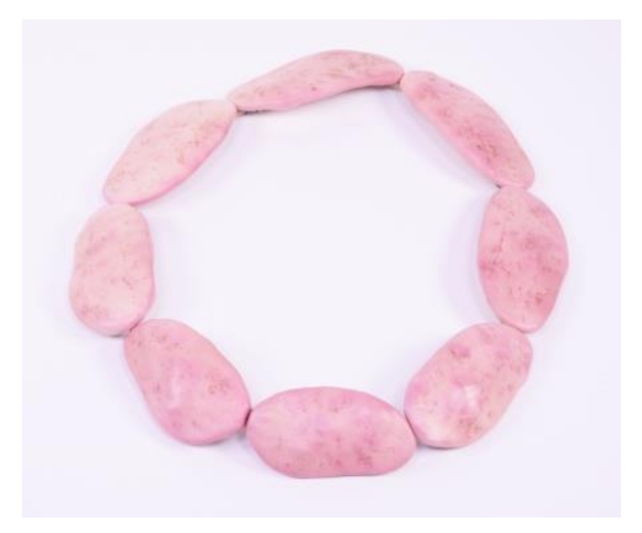
Tongues (neckpiece), 2018

Mango stones, beetroot dyed and moulded leather, stainless steel, iron, bamboo, 28 x 27 x 3.2cm