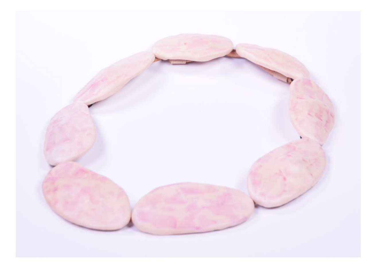
Tongues (neckpiece), 2018

Mango stones, beetroot dyed and moulded leather, stainless steel, iron, bamboo, 31 x 28 x 2.8cm