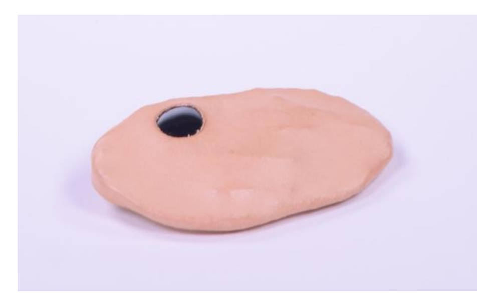
Tongue (brooch), 2019

Mango stones, beetroot dyed and moulded leather, stainless steel, iron, bamboo, 28 x 27 x 3.2cm